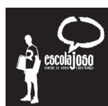
PHOTO AND VIDEO WORKSHOPS

C/ Violant de Hongria, 69 Barcelona 08028 Tel: +34 93 490 21 20 E-mail: info@escolajoso.com www.escolajoso.com/